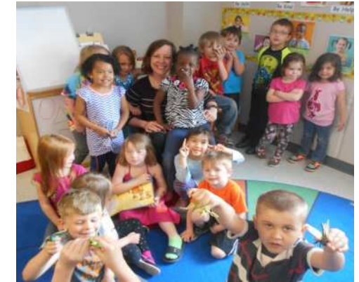
Children's Department visits five daycares and Head Start each month.

195 kids from grades 6-12 attended events for Teens