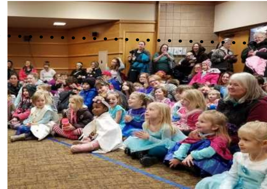
Snow Princess Event