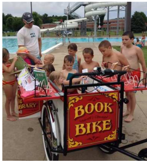
The Book Bike: Free Books at the Pool!