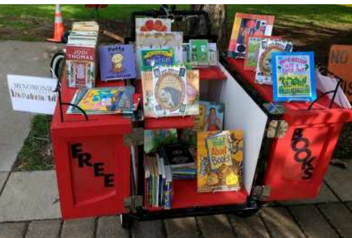
The Book Bike at the Farmer's Market